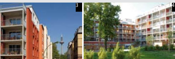
Photo 1 + 2: Grundschule am Riedberg with Gymnasium, Frankfurt/M. [Architekten 4a] Photo 3 + 4: Sophienhof, Frankfurt/M. Photo 5: Kindergarten Altkönigsblick, Frankfurt/M. [Klaus Leber Architekten, Darmstadt] Photo 6: St. Jakob, Frankfurt/M. [Faktor10]

» 1. Registration Registrations must be made in writing. They are binding and will be processed in the order in which they are received by the organiser. The number of participants is limited. After registration you will receive an invoice. The early booking discount is only granted if registration and payment are completed before 28 th February 2009. The conference can only be attended if the applicable fee has been paid in full. Cancellations are only accepted in written form. In case of withdrawal before 15 th March 2009, we will charge a processing fee of € 70; the full participation fee is due in case of later cancellation or non-appearance. A substituting participant can be named.