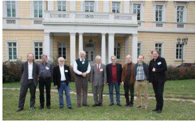
The Passive House Award jury at a meeting in Darmstadt.

terraced house in London (Paul Davis+Partners), an office building in the French town of Saint-Étienne (Atelier d'architecture Rivat), and a terraced brownstone in Brooklyn, New York (Fabrica718 / Studio Cicett Architect).