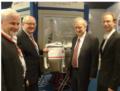
Pural Pural eco 90 (aluminium)