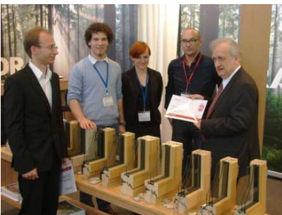
M Sora Natura Optimo XLT (wood)