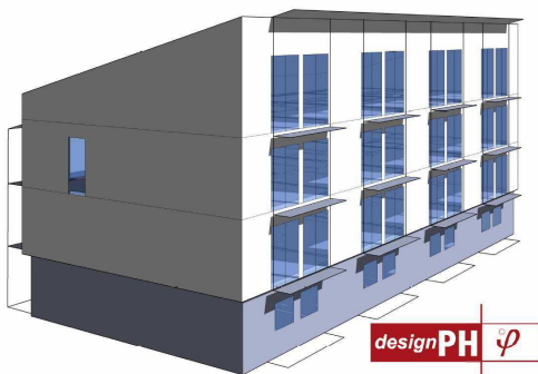
View of the first Passive House in Darmstadt, Germany, created using the designPH tool.