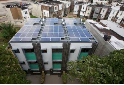
Belfield Homes (Philadelphia, USA).