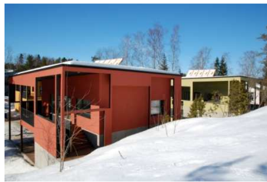
Oravarinne Passive Houses (Espoo, Finland).