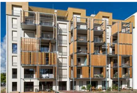
Zero-emissions house in Boyenstrasse (Berlin, Germany). Photo: Deimel Oelschläger Architekten