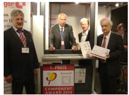
Hilzinger VADB-Plus 550 (Kunststoff)