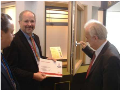
Lorber / pro Passivhausfenster Smartwin Compact (wood/aluminium)