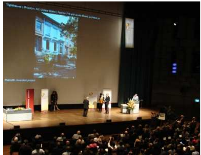
Six buildings and one region were recognised with the Passive House Award in Aachen, Germany.

As Sigmar Gabriel, German Federal Minister of Economic Affairs and Energy and patron of the Passive House Award, remarked in the official award press release, "The Passive House Standard serves as a global benchmark for energy efficient construction and refurbishment. I am especially pleased to see that the Standard is now having an impact not just for individual buildings, but is also serving as the basis for building complexes and even entire neighbourhoods". The prizes were presented by Deputy Assistant Minister Dr. Frank Heidrich during the opening plenary.