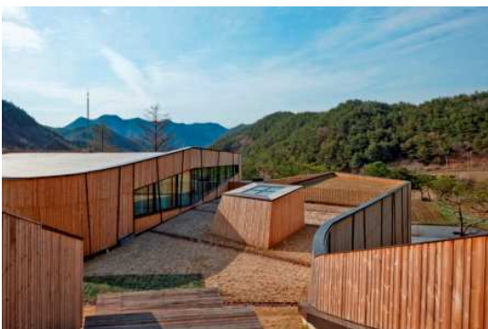
Seminar building and hostel (Goesan, South Korea).