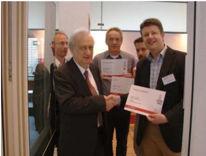
Optiwin Freisinger/Bieber; Holz-2-Holz, Alu-2-Holz, Futura (wood-aluminium)