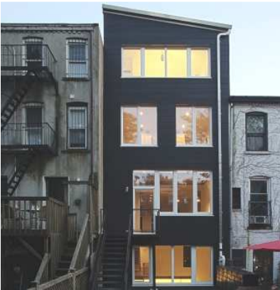
Tighthouse / Brooklyn (Retrofit in New York, USA).