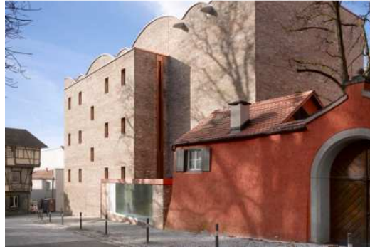
The art museum in Ravensburg, Germany.