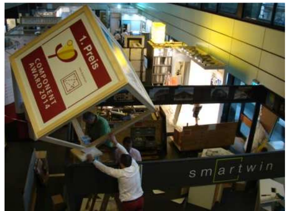
Manufacturers presented the latest product developments at the accompanying exhibition.

Examples such as these clearly show the increasing importance of refurbishment and experts predict that this will be the main focus of construction sector in the coming decades. In this area, too, it is necessary to opt for high levels of energy efficiency. Attaining the Passive House Standard in existing buildings can prove difficult, however, and it is in such cases that the EnerPHit-Standard can be applied. As individual building components typically exhibit different life spans, it may be most sensible to implement refurbishment measures in a step by step manner. This approach is the subject of the EU project, EuroPHit, which also played a role in various conference lectures as well as framework events such as the “Components across the globe workshop”, attended by some 70 interested stakeholders prior to the Conference. A wealth of information on the critical subject of components for Passive House and high performance building was also available at the exhibition that accompanied the Conference, where members of the public could learn about the latest developments in the field.