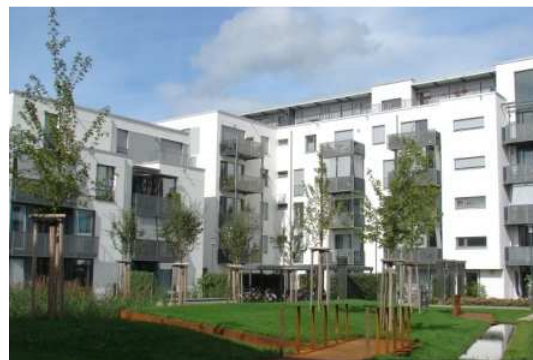
Passive House district "Bahnstadt" in Heidelberg, Germany.