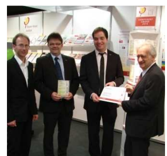
Raico Bautechnik Frame 90 WI (aluminium)