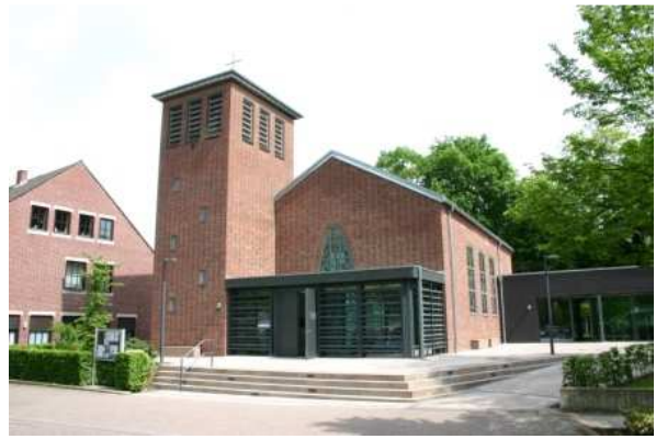
A church in Heinsberg retrofitted to the EnerPHit Standard using Passive House components.

Examples such as these clearly show the increasing importance of refurbishment and experts predict that this will be the main focus of construction sector in the coming decades. In this area, too, it is necessary to opt for high levels of energy efficiency. Attaining the Passive House Standard in existing buildings can prove difficult, however, and it is in such cases that the EnerPHit-Standard can be applied. As individual building components typically exhibit different life spans, it may be most sensible to implement refurbishment measures in a step by step manner. This approach is the subject of the EU project, EuroPHit, which also played a role in various conference lectures as well as framework events such as the “Components across the globe workshop”, attended by some 70 interested stakeholders prior to the Conference. A wealth of information on the critical subject of components for Passive House and high performance building was also available at the exhibition that accompanied the Conference, where members of the public could learn about the latest developments in the field.