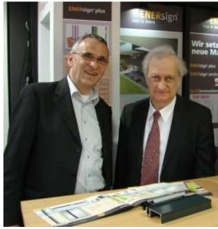
Pazen; ENERsign arctis (lowest heat losses)