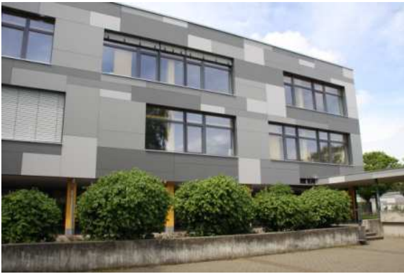
A school in Baesweiler, Germany, which was refurbished to the Passive House Standard was the destination of one excursion.