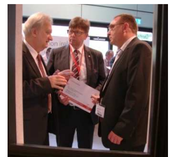
Deutsche Passivhaus Transfer (dPHt); Delta Plus Cold Climate (wood/fibreglass synthetic material)